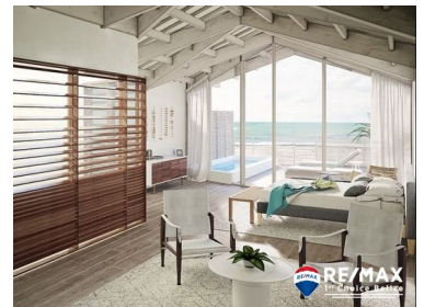
ONE BEDROOM LOFT COTTAGE

You want a luxury lifestyle on the Caribbean. Here it is. Twenty-one Villas and eighteen Cottages elevate waterfront living to new horizons. One Bedroom Solar Loft Cottage Itzâ™ana is a luxury resort and residential community on the Placencia Peninsula. The one bedroom loft cottage is designed as a chic and elegant home away from home that marries style and functionality. They are located in a stunning waterfront setting and feature two levels of living space. The downstairs area features an outdoor over water deck, kitchen, and living-room with a sleeper-sofa and bathroom. The mezzanine level bedroom extends to encompass a study and rooftop deck overlooking the water. Perfect to watch the sunset over the Maya Mountains with a cocktail in hand. Each cottage is designed to evolve as the day progresses, allowing the owner to relax, work or entertain guests as needed. The loft offers a wonderful indoor-outdoor flow, with waterfront exterior space on both levels. Of the 1200 square feet of total space, the interior 715 square feet is air-conditioned. Designed in New York, made in Central America, the Loft Cottage marry style and substance, making it a truly special... contact agent for more info.